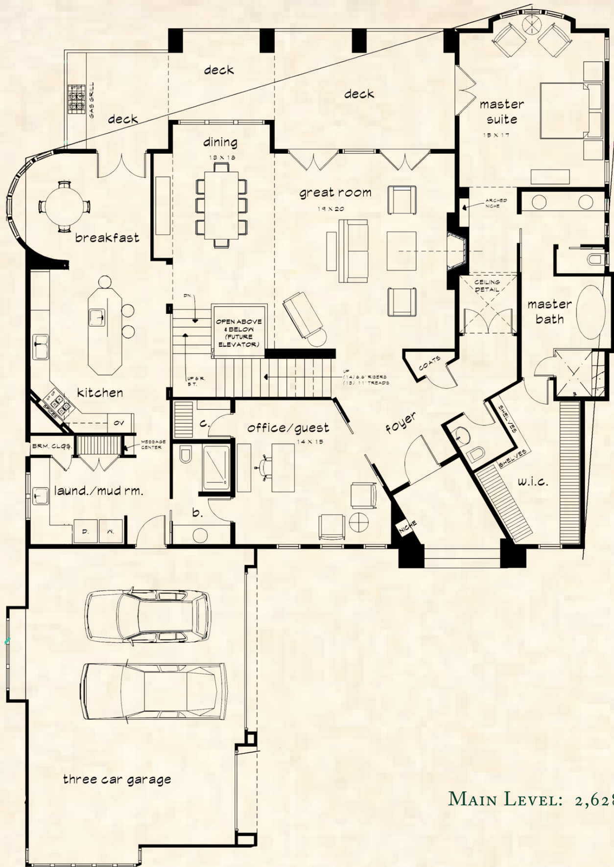
MAIN LEVEL: 2,628 SQ FT